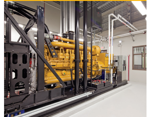
NMC Power Systems installed four Cat® 3516 diesel generator sets and a customized Cat switchgear system to power Scott Data Center, earning the building a Tier 3 certification.